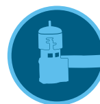
Mini-Clik Sensor Page 135