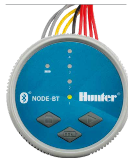
NODE-BT Diameter: 3½" Height: 3"

The Bluetooth® word mark and logos are registered trademarks owned by Bluetooth SIG Inc. and any use of such marks by Hunter Industries is under license. iOS is a trademark or registered trademark of Cisco in the U.S. and other countries and is used under license. Android is a trademark of Google LLC.