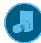
Freeze-Clik Sensor Page 142